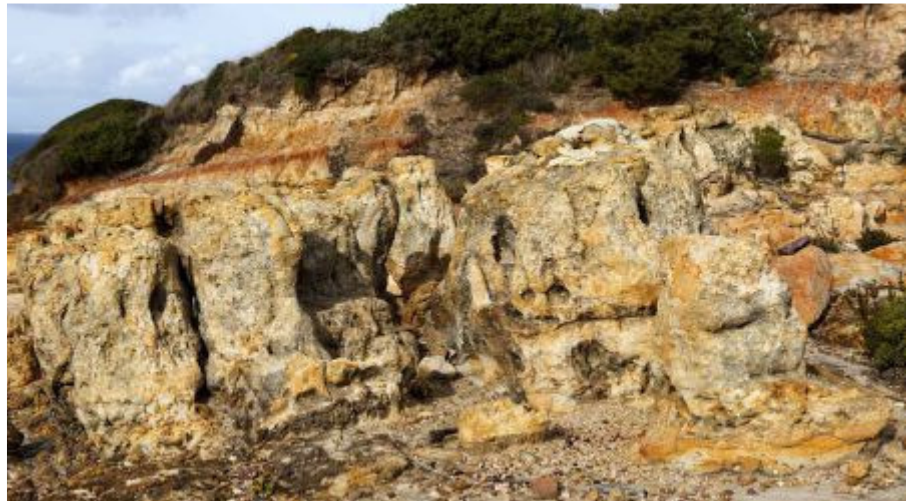
Wind and water erosion shapes the local stone.