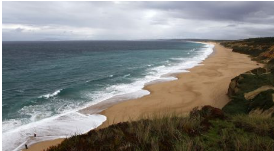
Portugal's Atlantic Coast close to Sesimbra, seen on the Medos do Penedo circular walk.